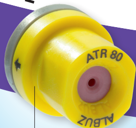
European Color code